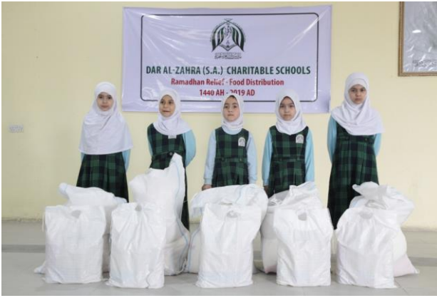
Ramadhan Relief – Food Distribution 1440AH (2019)