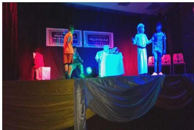
Drama play - Cart of uncle Shaker