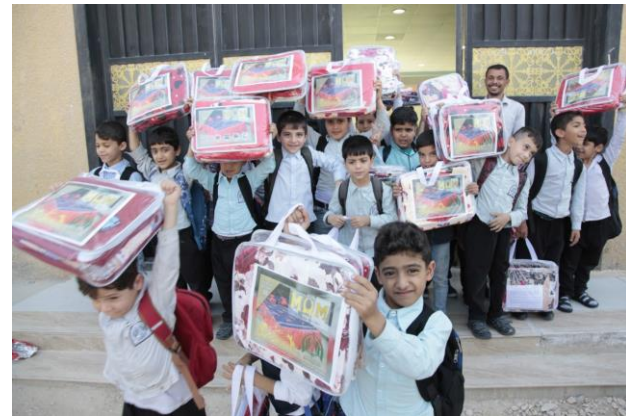
Students receive Ramadan/Eid gift