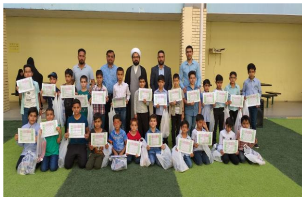
Students receive report cards