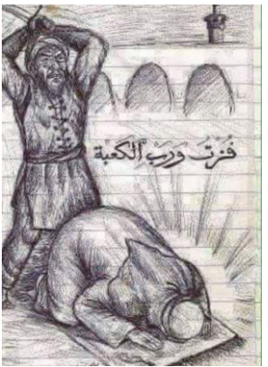
Martydom of Imam Ali (a.s)