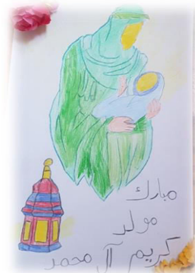
Birth anniversary of Imam Hassan (a.s)