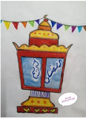
Mahe Ramadhan Kareem