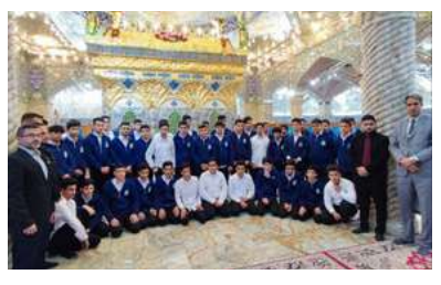
MATHAM AL-THAMMAR SHRINE